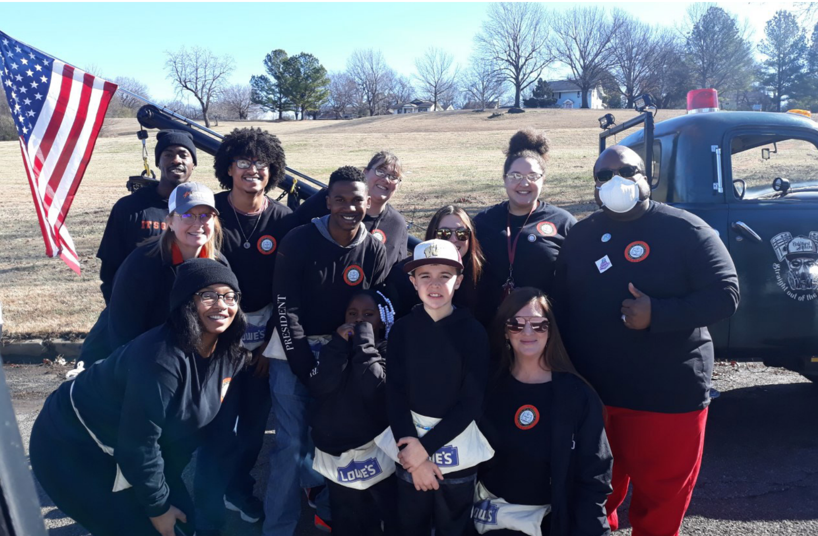
Connors students, faculty and staff participate in Muskogee's MLK Day Parade.